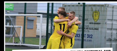
EMPOWER OUR COMMUNITIES TO FULFILL POTENTIAL AND OPPORTUNITY