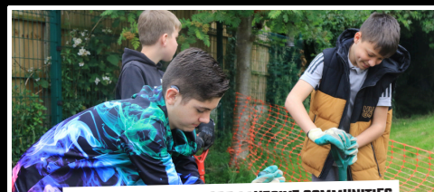
CREATE SAFER AND MORE COHESIVE COMMUNITIES

SUBJECTIVE MENTAL WELLBEING LEVELS OF PHYSICAL ACTIVITY SUBJECTIVE PHYSICAL WELLBEING