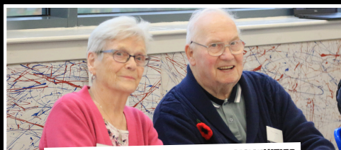
DEVELOP HEALTHIER AND HAPPIER COMMUNITIES